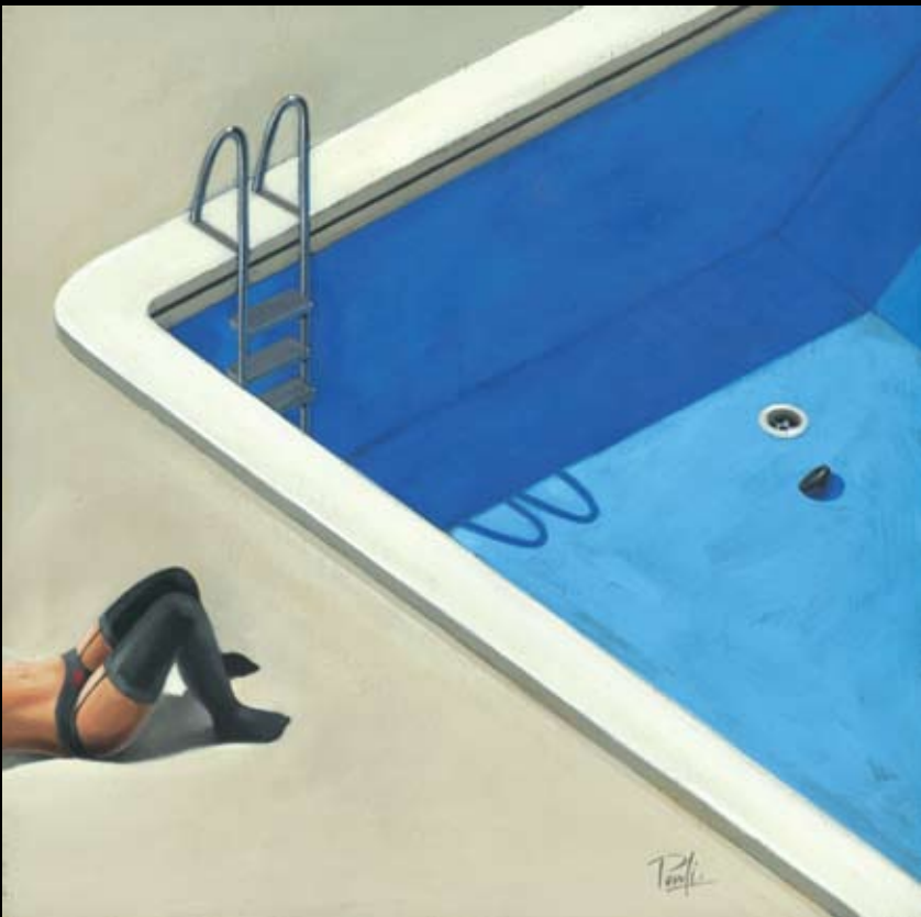
The Pool of Dreams acrylic on board 29.5 x 29.5 cm (45 x 45 cm)