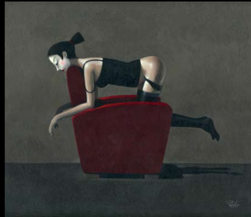
A Prelude acrylic on board 30 x 26cms (38.5 x 34.5cms)