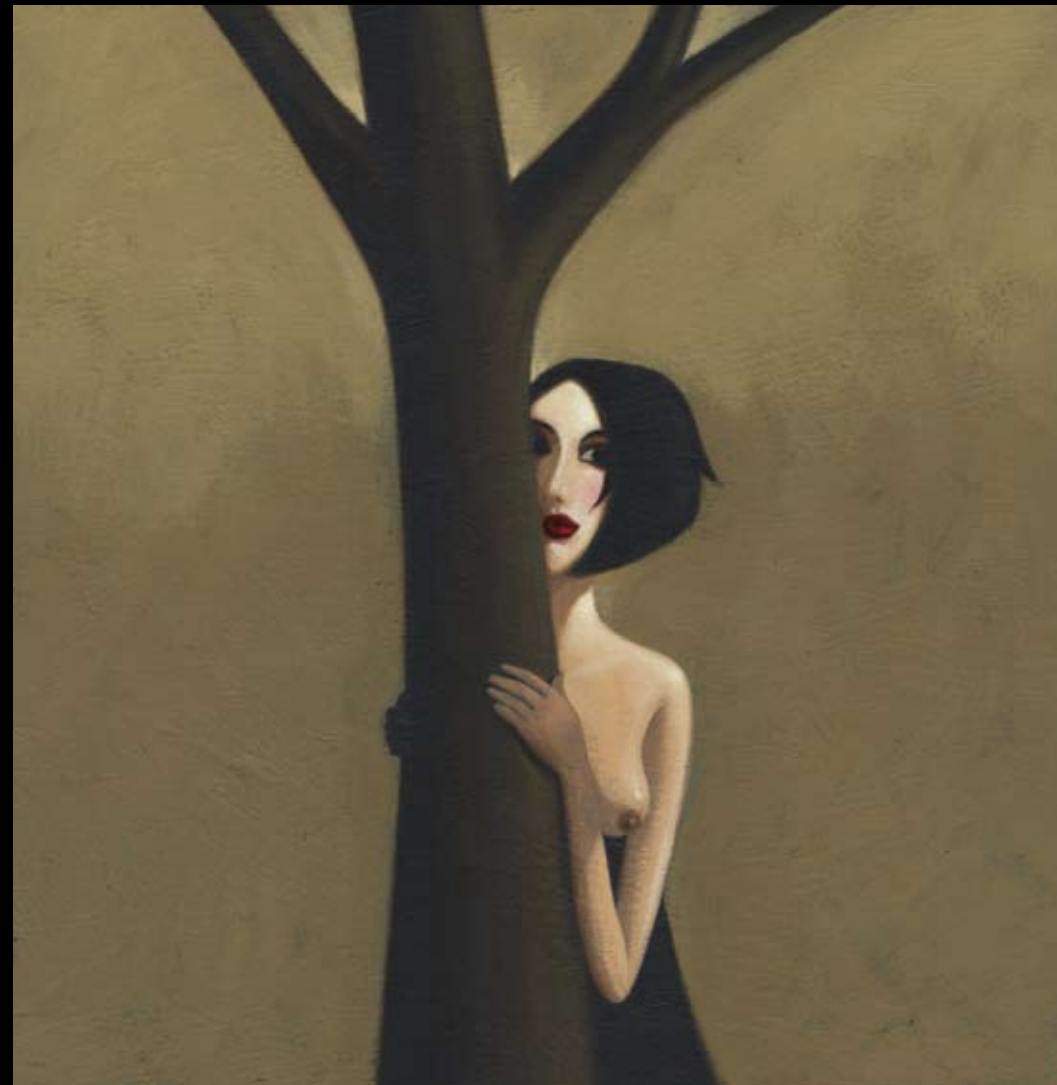
The Virgin in the Secret Forest acrylic on board 24 x 24 cm (43 x 43 cm)