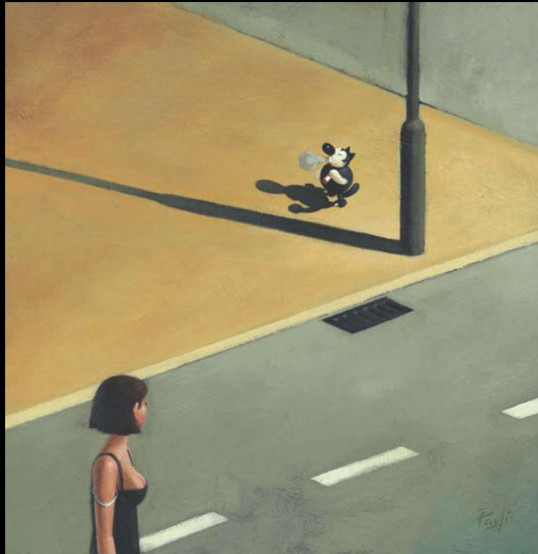
The Smokin' Cat acrylic on board 29.5 x 29.5 cm (45 x 45 cm)