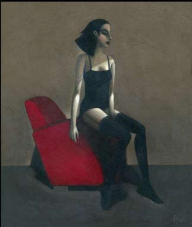
A Private View acrylic on board 30 x 26cms (38.5 x 34.5cms)