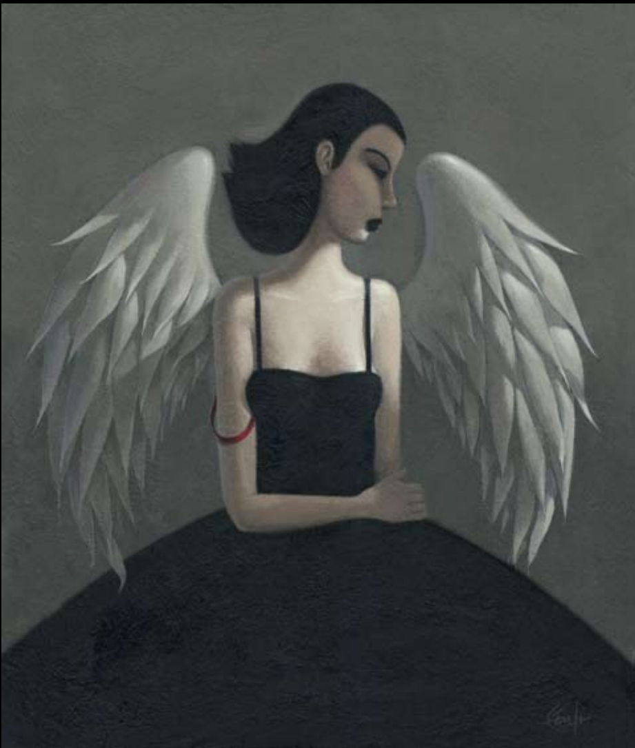
The Dark Angel acrylic on board 24 x 29 cm (43 x 48 cm)