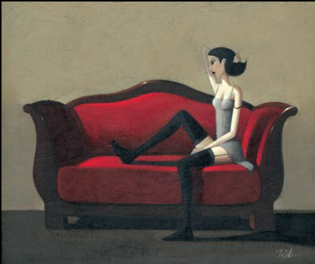
The Casting Couch acrylic on board 28.5 x 24 cm (47 x 43cm)