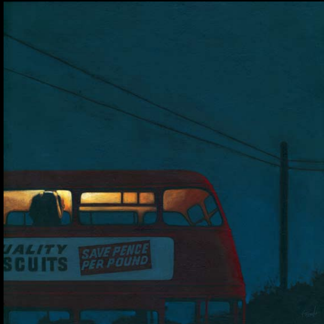
The Liaison acrylic on board 29 x 29 cm (48 x 48 cm)