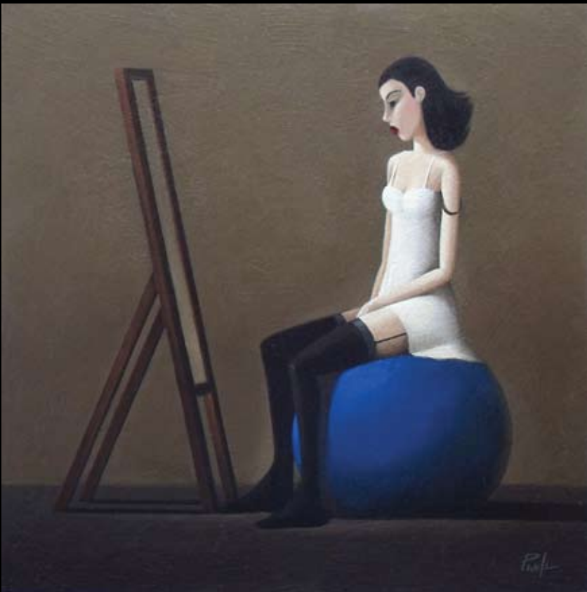
Reflective Solitude acrylic on board 29 x 29 cm (48 x 48 cm)