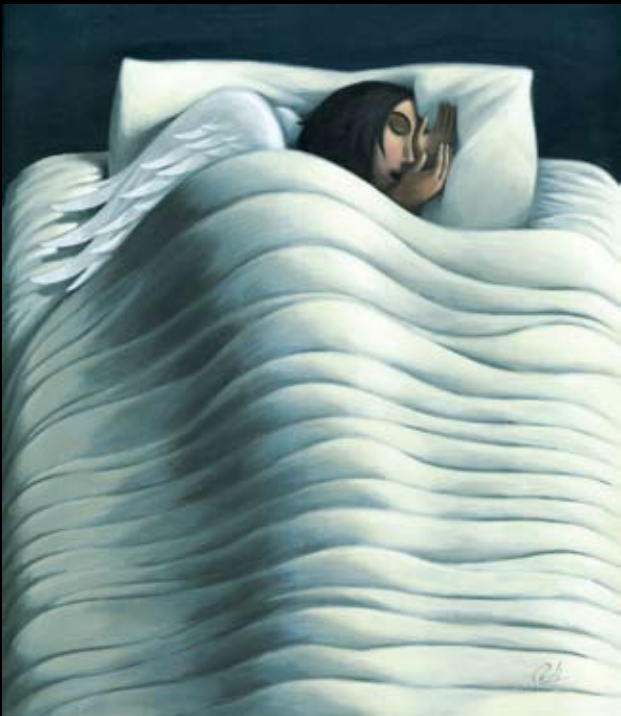
The Sleeping Beauty acrylic on board 28.5 x 34 cm (48 x 53 cm)