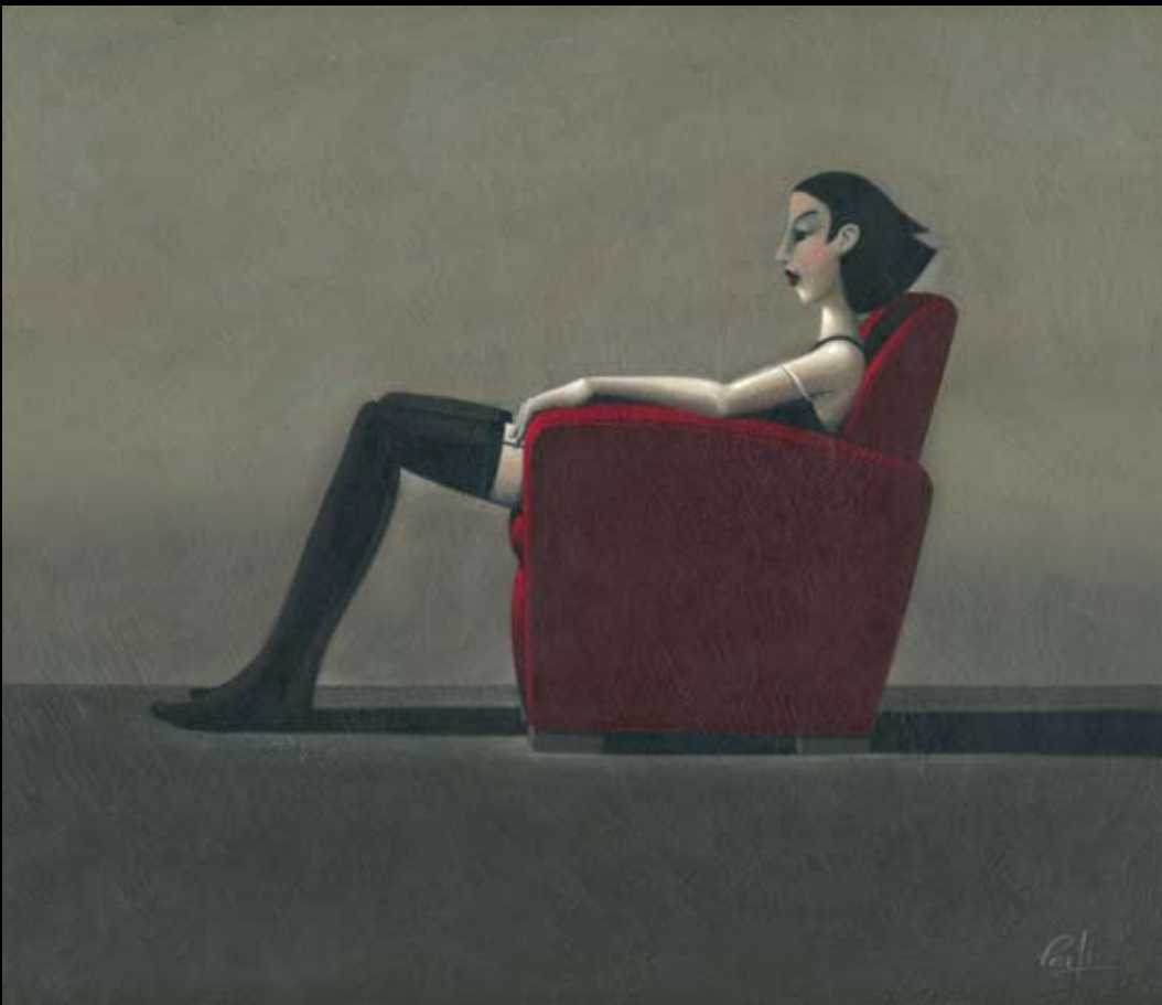
Invisible Silence acrylic on board 34 x 29cms (50 x 45cms)