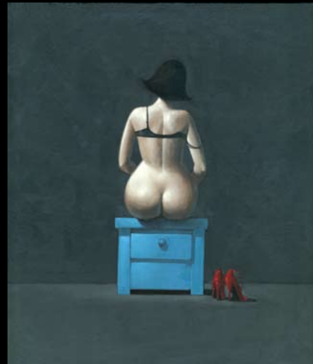
The Red Shoes acrylic on board 29 x 33.5 cm (48 x 53 cm)